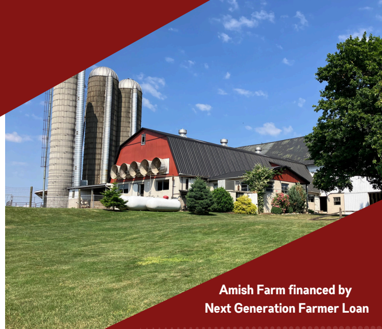
Amish Farm financed by Next Generation Farmer Loan

The Chester County Industrial Development Authority (CCIDA) was established by the County of Chester as an industrial development authority in 1969 under state statute. The CCIDA is governed by a nine-member Board appointed by the County Commissioners and is administered by the Chester County Economic Development Council (CCEDC).